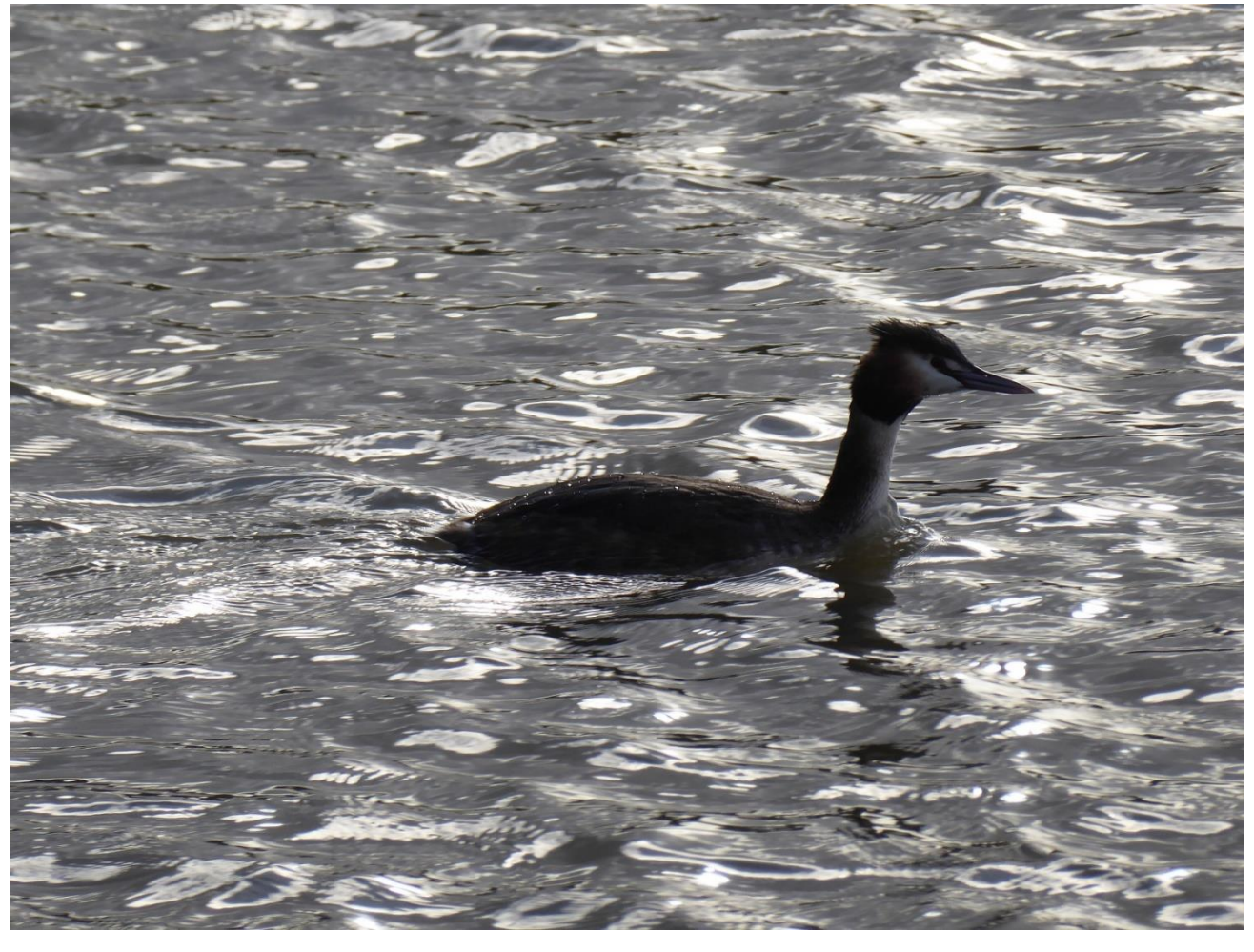
Rod saw the Great Crested Grebe above at Poolsbrook; the Long Tailed Tits below are on his garden feeder.