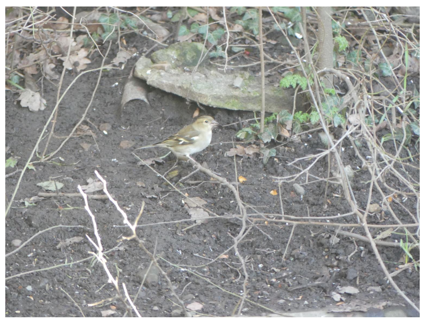
Chaffinch above, Heron below.