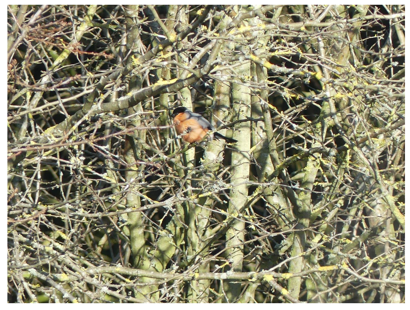
Bullfinch above, Pike below.