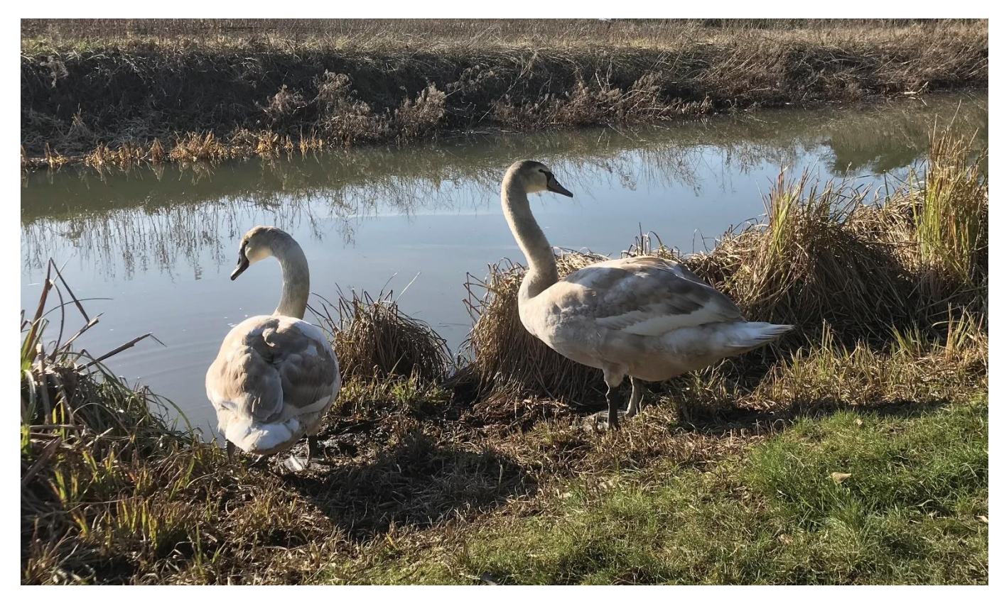
Dawn Bussingham saw these Cygnets at Forest Locks.