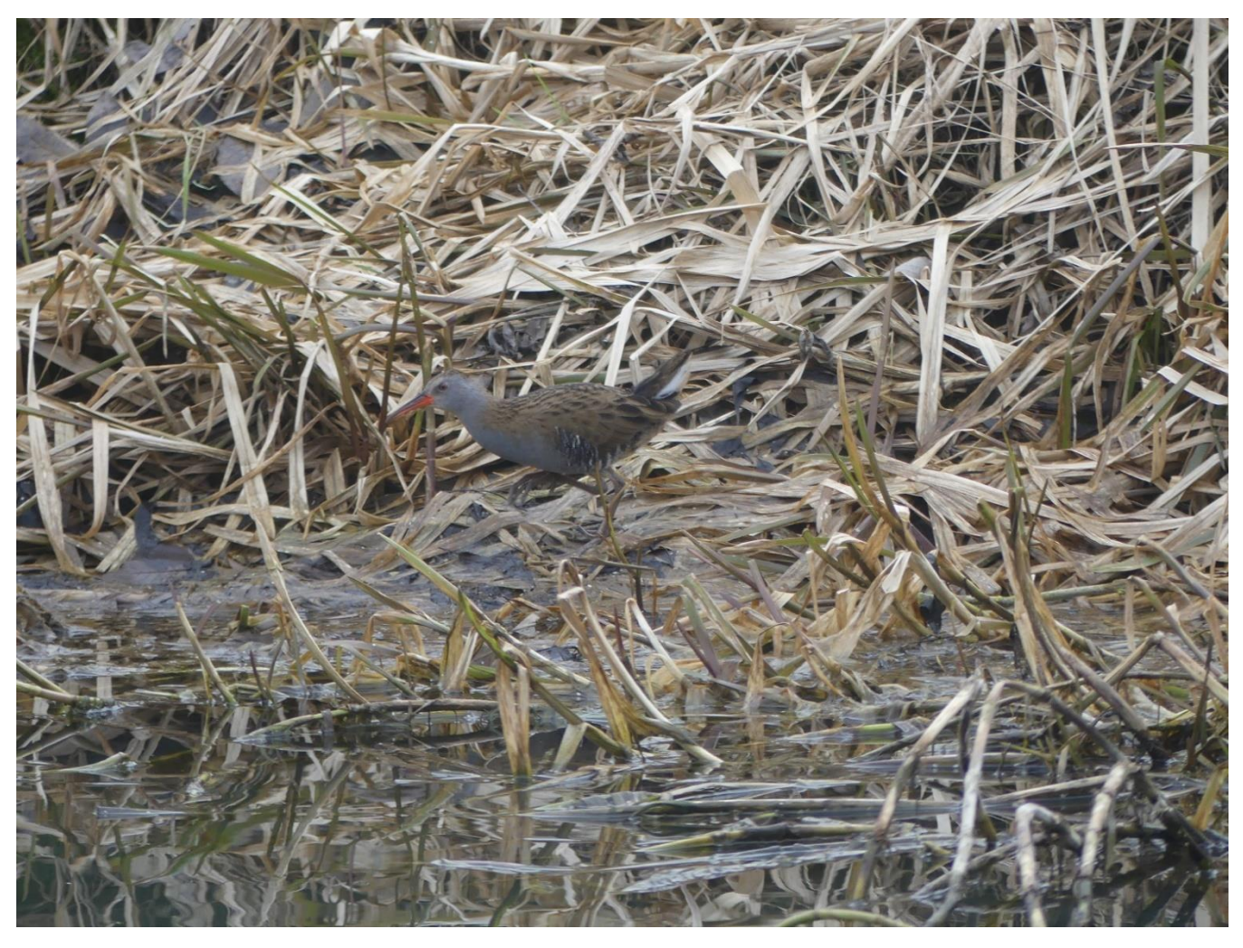
Water Rail above, Coot below.