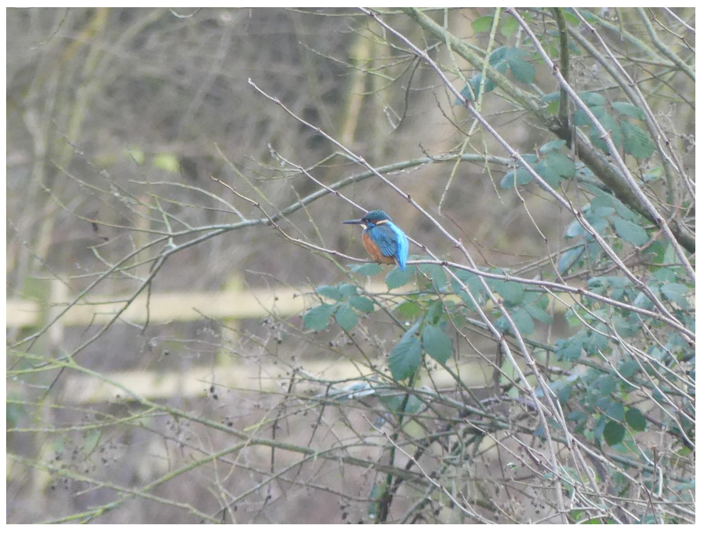
Kingfisher above, Buzzard below.