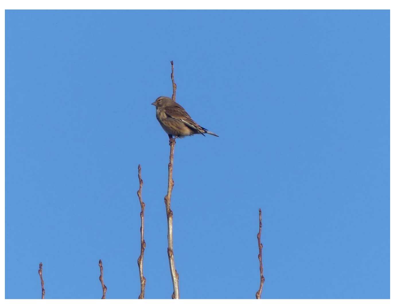
Linnet above, Dunnock below.