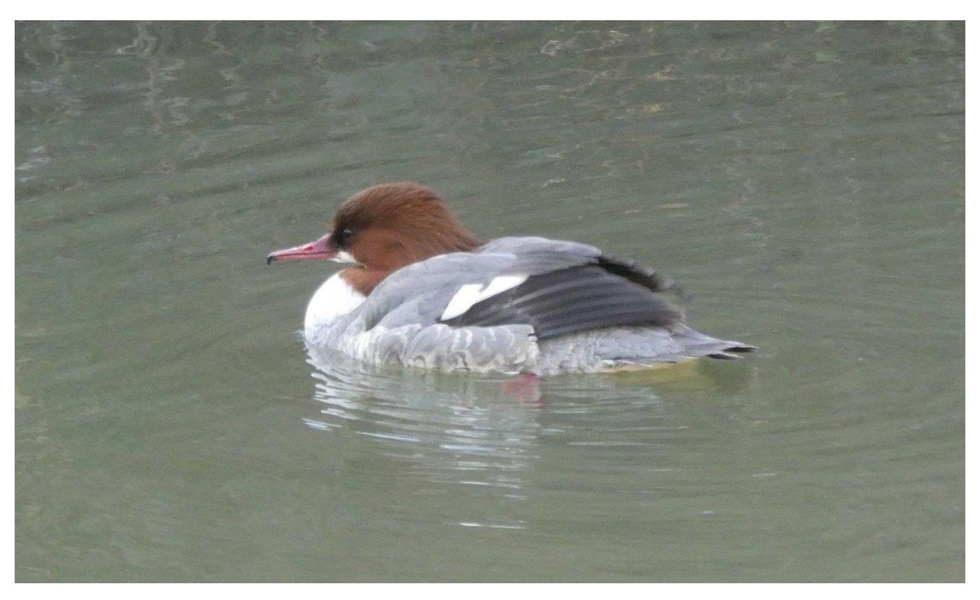
Roger saw these Goosanders, female above, male below, at Bluebank.